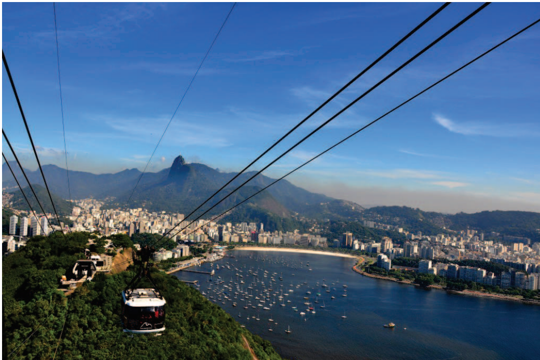
Photograph 1. The label of the photograph should be placed here.

Do not use footnotes unless strictly necessary and in this case, try not to group them. Please make sure you have included address, affiliation and the e-mail of the authors as a footnote on the first page, as shown in this example. Photograph 1 and Frame 1 are a practical examples.